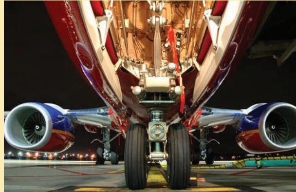
Landing gear is an ideal application for ANP1012.

In aircraft manufacturing, it's an "overhaul" product suitable for landing gears and struts. Pumps, housings and tubular goods are key applications within the chemical processing industries. And in the electronics sector,